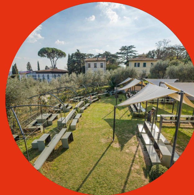
Unicollege campus (Florence)